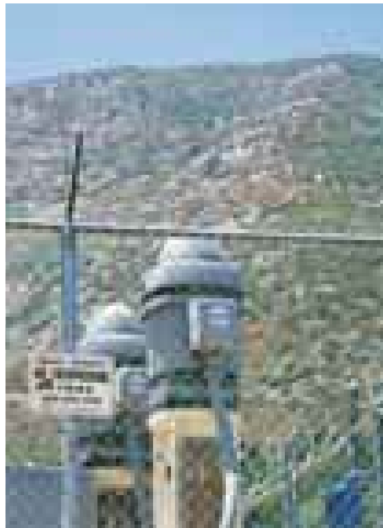
The Sky Meadows Booster Station was experiencing frequent shut downs on its two 100-Hp motors and pumps, caused by voltage unbalances and subsequent current unbalances reaching the pump station. Each time the station experienced a motor and pump shut down, a technician was needed to manually re-set the motor controller.

The motor management solution installed at the Sky Meadows Booster Station has significantly improved pump reliability and minimized the threats to the water supply of the Rancho Capistrano community. The pumps now operate without interruption via a radio telemetry system at the Elsinore Valley