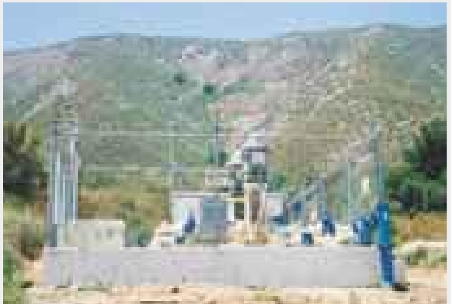
Elsinore Valley Municipal Water District's Sky Meadows Booster Station is remotely located alongside an area of mountains known as the Cleveland National Forest in Southern California. Each day, the Sky Meadows Station pumps approximately 190 m 3 of water to Rancho Capistrano, a small community located on a plateau 490 m above the station.

To eliminate the motor/pump shut downs and secure a constant water supply to Rancho Capistrano, the