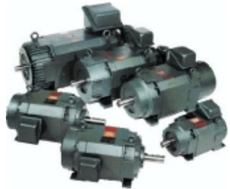
Bulletin 1329L high performance motors are Control-Matched with Allen-Bradley drives for optimum performance and value.