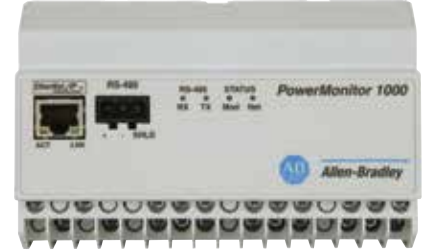
PowerMonitor 1000 BC3

Energy management and understanding energy costs are a major focus today in the industrial market. The Allen-Bradley® Bulletin 1408 PowerMonitor 1000 is a cost-effective energy monitor that is ideal for your applications where load profiling, cost allocation, or energy optimization is required. It also provides seamless integration to optimize your existing energy monitoring systems where sub-metering is required. The PowerMonitor 1000 is available in three models with features and a price point to meet your application.