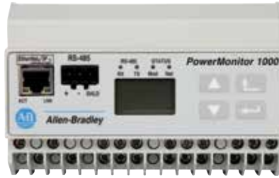
PowerMonitor 1000 EM3 and TS3A