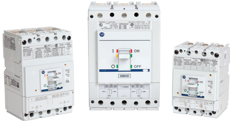
140G J-Frame 250A

Current-limiting molded case circuit breakers (MCCBs) are rated to open in less than half of a cycle under fault conditions.