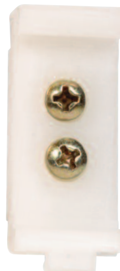
DIN Rail Adapter 140U-G-DRA2