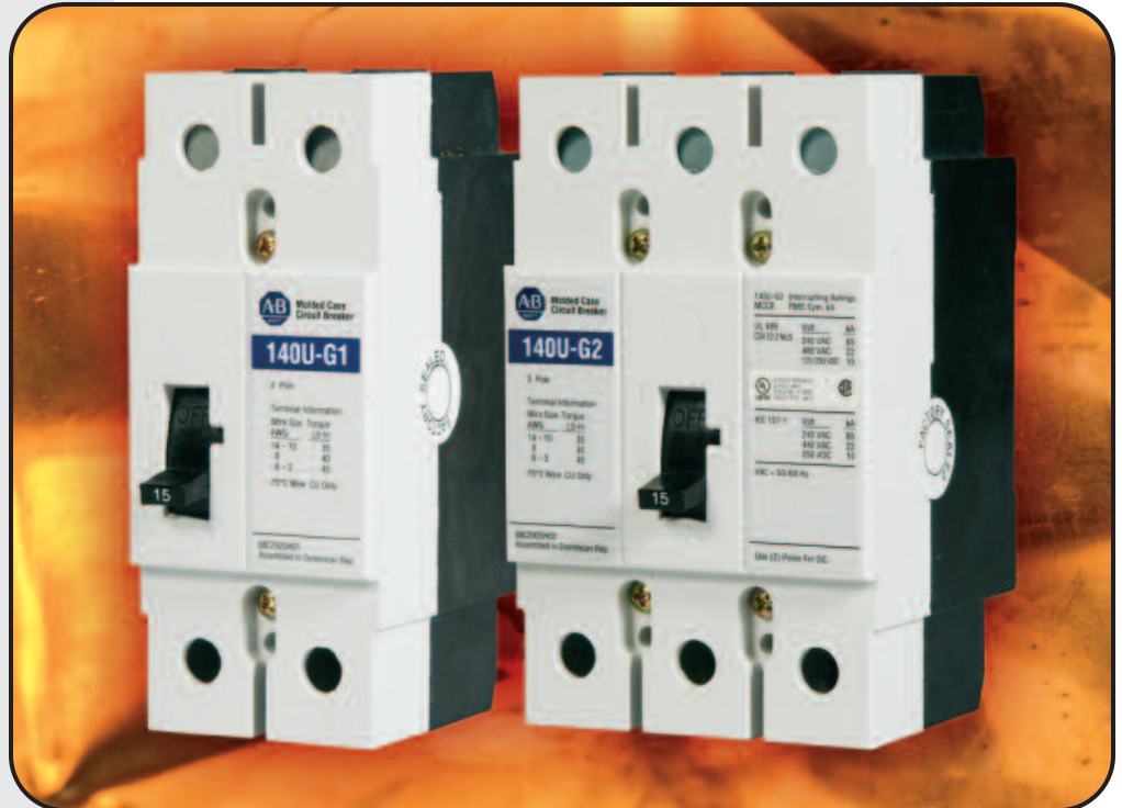
140U Molded Case Circuit Breakers 2 and 3 Poles