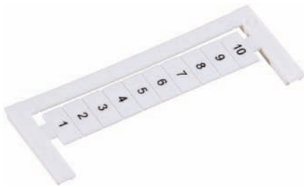
Pre-printed Marker Cards printed with ClearMark Printer