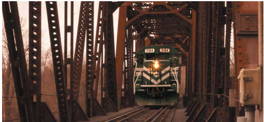
Intersections and other high-traffic sections of a railroad are required by law to have a signaling systems. The green, yellow, and red signals on P&L's Rockport drawbridge can alert trains to the presence of other trains or boats, broken rails and improperly functioning switches.