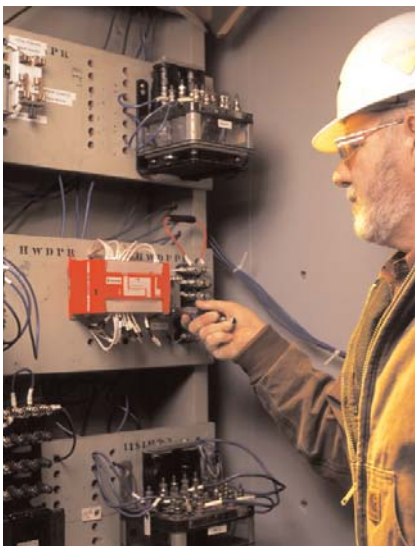
The Allen-Bradley GuardPLC, which is housed in a 8X10' concrete enclosure monitors the Rockport bridge's interlocks, span locks and rail lifts to ensure fail-safe operation.

P&L was especially interested in incorporating technology that was certified fail-safe and met the new guidelines set forth in the International Electro-Technical Commission (IEC) 61508 standard for functional safety of electrical, electronic, programmable electronic safety systems. "The safety guidelines and product testing procedures are much more advanced than in the past, and the resulting quality assurance is priceless in an industry like ours," Edwards explains. P&L was also attracted to the possibility of reducing ongoing maintenance.