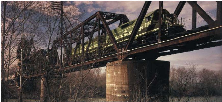
Paducah & Louisville's Rockport drawbridge, spanning 520 feet over the Green River, was built in 1931 and is equipped with a bascule-type lift.

Allen-Bradley's GuardPLC™ ensures safety and helps reduce maintenance of drawbridge by 50 percent