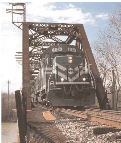
The most recent safety initiative at Paducah & Louisville Railway involved improving the technology on its signaling systems. The system used on the Rockport drawbridge safely governs the movement of freight trains.

The single most important feature of the PLC is its fail-safe components. The GuardPLC uses redundant CPUs in a single PLC controller body. Each of the logic circuits within the controller – supporting digital and analog inputs, outputs, timers, and counters – contain several checkpoints. If a failure is monitored, the PLC is designed to conduct an orderly equipment shutdown. Since the highest safety integrity level (SIL) that can be claimed for the entire signaling system is limited by the fault tolerance of its subsystems, the certification of every component is critical.