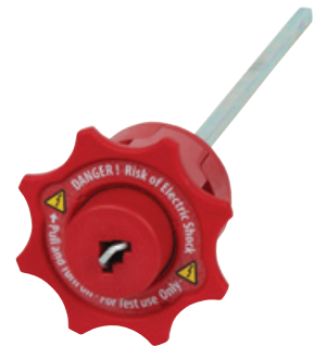
194R-N1 NFPA Internal Operating Handle with shaft for use with S-Style and P-Style Handles