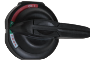
Catalog Number 194R-PBT