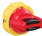
Catalog Number 140M-SY