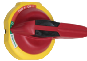
Catalog Number 140U-PY