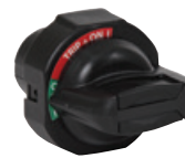
Catalog Number 194E-SB