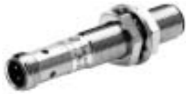
872C DC Micro Quick-Disconnect Style 12, 18, 30mm page 2-59

Plastic Face/Threaded Nickel-Plated Brass Barrel