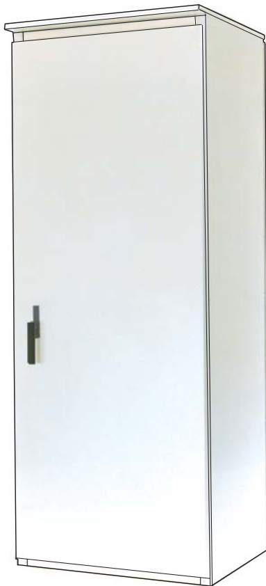
Figure 1 NEMA 3R Enclosure