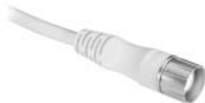
12-Pin M23 Cordset