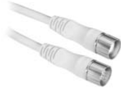
12-Pin Male to Female M23 Patchcord