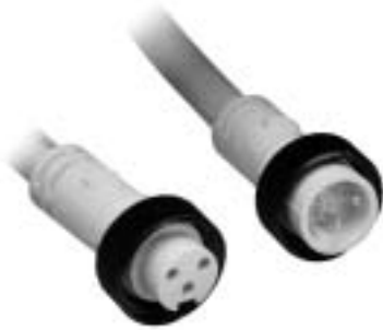
Mini Male to Mini Female