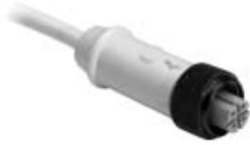
4-Pin EAC Micro Cordset