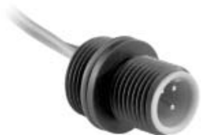
EAC Micro Male Receptacle